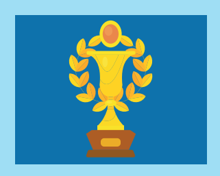
Variety of awards given at Sports Awards Evening (Annual Event)